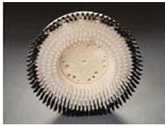
Carpet Brush: 6011 13" 6014 17" 6020 20"

These carpet brushes massage the dirt from the carpet for a deeper cleaning action. They are a Nylon mix.