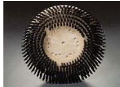
Poly Scrub Brush: 6022 17" 6024 20"

These carpet brushes massage the dirt from the carpet for a deeper cleaning action. They are a Nylon mix.