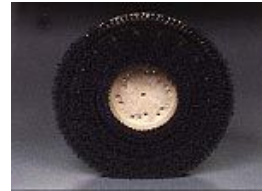
Bassine Scrub Brush: 6022-BAS 17" 6024-BAS 20"

The poly scrub brush is highly resistant to chemicals, fungus, and bacteria. It is ideal for general scrubbing, wet scrubbing, as well as stripping and re-coating applications.