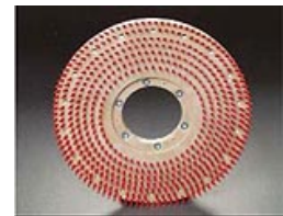
Pad Driver: 6010 13" 6012 17" 6013 20"

These polish brushes have a combination of Palmyra and White Tampico and are used in hard surface polishing applications.