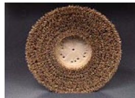
Polish Brush: 6021 17" 6023 20"

This is the most aggressive grit brush. It has a heavier gauge nylon with a larger grit and is used for aggressive scrubbing of concrete surfaces and aggressive stripping of resilient floors.