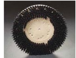
Scrub Grit Brush: 6016-SCRUB 17" 6017-SCRUB 20"

The bassine scrub brush is used for general scrubbing purposes. Its water absorption properties make it an excellent, affordable, choice for hard surface scrubbing.