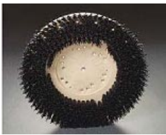
Nylon Grit Brush: 6016 17" 6017 20"

The scrub grit brush works excellent for frequent maintenance cleaning. It is flexible enough for cleaning narrow grout lines and uneven surfaces.