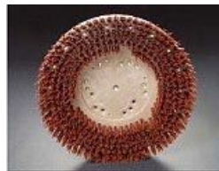
Strata Grit Brush: 6016-STRATA 17" 6017-STRATA 20"

The nylon grit brush is a very popular aggressive brush used for general scrubbing and stripping finishes on hard surfaces. It can also be used to clean wide grout lines.