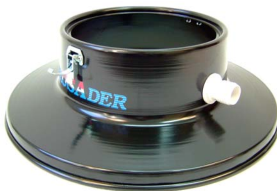
#8055A Drum Adapter Only

The 55 gallon cart is made of heavy duty powder coated steel and is much more sturdy than a standard drum dolly. It features 10" pneumatic wheels and 4" heavy duty extra wide front casters for easy maneuverability across rough terrain.