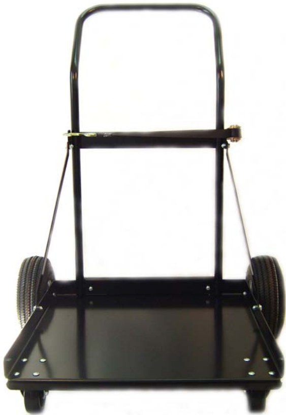
#8055-CART 55 Gallon Cart

The 55 gallon cart is made of heavy duty powder coated steel and is much more sturdy than a standard drum dolly. It features 10" pneumatic wheels and 4" heavy duty extra wide front casters for easy maneuverability across rough terrain.