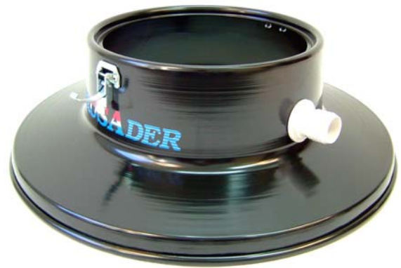
#8055A Drum Adapter Only

The 55 gallon cart is made of heavy duty powder coated steel and is much more sturdy than a standard drum dolly. It features 10" pneumatic wheels and 4" heavy duty extra wide front casters for easy maneuverability across rough terrain.