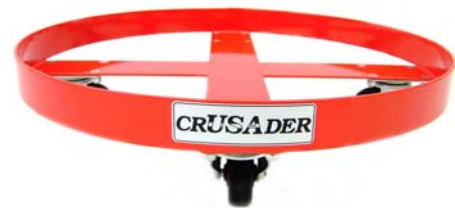
#4077 55 Gallon Drum Dolly

For use with your existing powerhead, float cage assembly, filter bag, and hose from your 15 or 30 gallon vacuum