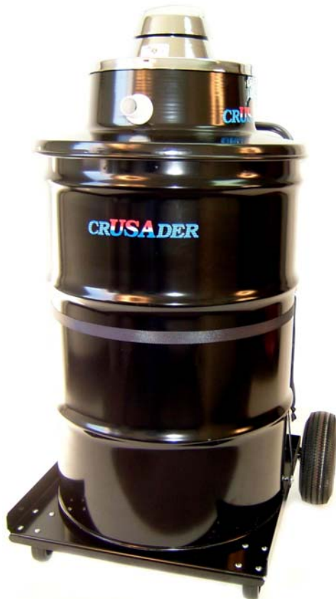
M1050-55-CC with optional #8055-CART 55 gallon cart shown above. (Drum not included)

The 55 gallon series vacuums from Crusader are available for those large recovery jobs when a 15 or 30 gallon vacuum is just too small. They are affordable, powerful units designed to fit any standard steel drum. Add the sturdy 55 gallon cart (#8055-CART) available exclusively from Crusader for easy maneuverability across rough terrain on the jobsites. This vacuum comes equipped with a filter bag for wet slurry recovery but can also be used for dry recovery with the proper filters (4049 coated bag, 4031 filter protector).