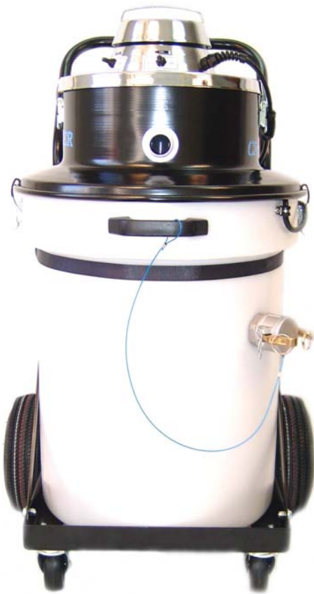
M1050-30-PUMP Shown above

The Crusader 30 Gallon Continuous Pump-out Vacuum is great for pumping into a containment truck or tank outside while you continue to work inside. This vacuum can pump while you vacuum, or can pump when you're done vacuuming. The pump-out vacuum is great for pumping down one or more flights of stairs instead of trying to wheel a vacuum tank full of concrete slurry down a stairs. Save on workers compensation from employees hurting their backs while lifting heavy barrels full of concrete slurry - PUMP IT OUT!