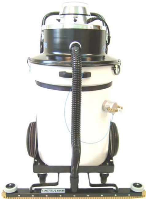
#4017-CART 30 gallon 30" Front Mount Squeegee shown on 30 gallon