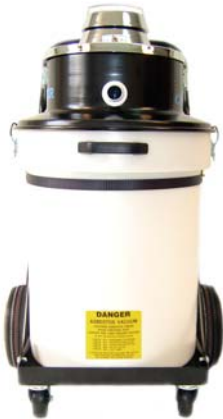
30 Gallon Utility Series H.E.P.A. shown above.