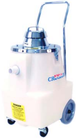
15 gallon Utility Series H.E.P.A. Vacuum shown above.

The Crusader critical filter vacuums offer you a filter retention efficiency of 99.97% at .3 micron particle size. All models feature a multiple stage filtration process to protect the (H.E.P.A.) filter from premature failure. All of our H.E.P.A. critical filters are individually DOP tested and certified to safely filter dry hazardous materials. The vacuums are available in several different tank capacities with several different motor options.