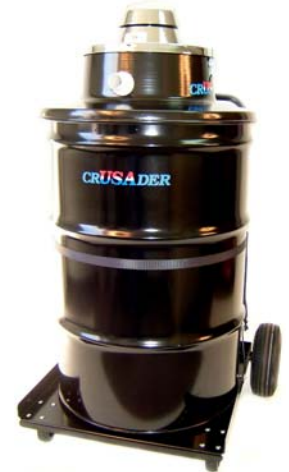
Utility Series H.E.P.A. 55 gallon drum adapter with optional #8055-CART 55 gallon cart shown above.