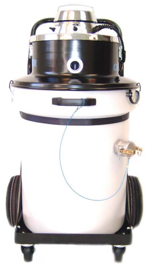
M1050-30-PUMP Shown above

The Crusader 30 Gallon Continuous Pump-out Vacuum is great for pumping outside or to a drain while you continue to work inside. This vacuum can pump while you vacuum, or can pump when you're done vacuuming. The pumpout vacuum is great for pumping down one or more flights of stairs instead of trying to wheel a vacuum tank full of heavy liquids down a stairs. Save on workers compensation from employees hurting their backs while lifting heavy containers full of liquids - PUMP IT OUT!