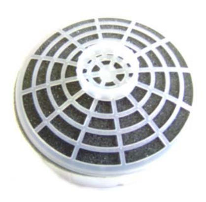
4061 "Absolute" Filter