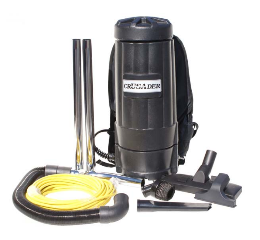
3040 Walkabout backpack vacuum shown with standard tools & accessories

The 3040 Walkabout backpack vacuums from Crusader are very powerful, quiet, versatile, and comfortable. These affordable compact units are designed for superior carpet and upholstery cleaning. They are ideal for vacuuming in situations where there isn't enough room for a canister style vacuum. The ergonomic harness system postions all the weight directly over the hips and allows the operator complete freedom to bend, twist, and reach.